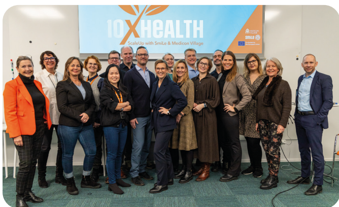
Kick-off January 2024

Neola Medical is proud and honored to be graduates of the 10xHealth life science scale-up program, a transformative initiative for accelerated growth developed by SmiLe Venture Hub in close collaboration with Medicon Village Innovation and partially funded by the European Regional Development Fund. Over the course of nearly a year, the program has equipped the company with invaluable tools, insights, and strategies to accelerate its growth and amplify its impact in the life science sector.