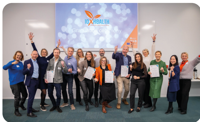
Graduation Ceremony November 2024

The new 10XHealth program is designed for established life science companies in southern Sweden, with the goal of supporting their commercial successes and simultaneously strengthening the life science industry in Skåne. The program runs for a year, during which companies have the opportunity to receive guidance from experts in areas crucial to the scale-up process for a life science company. Read more here .